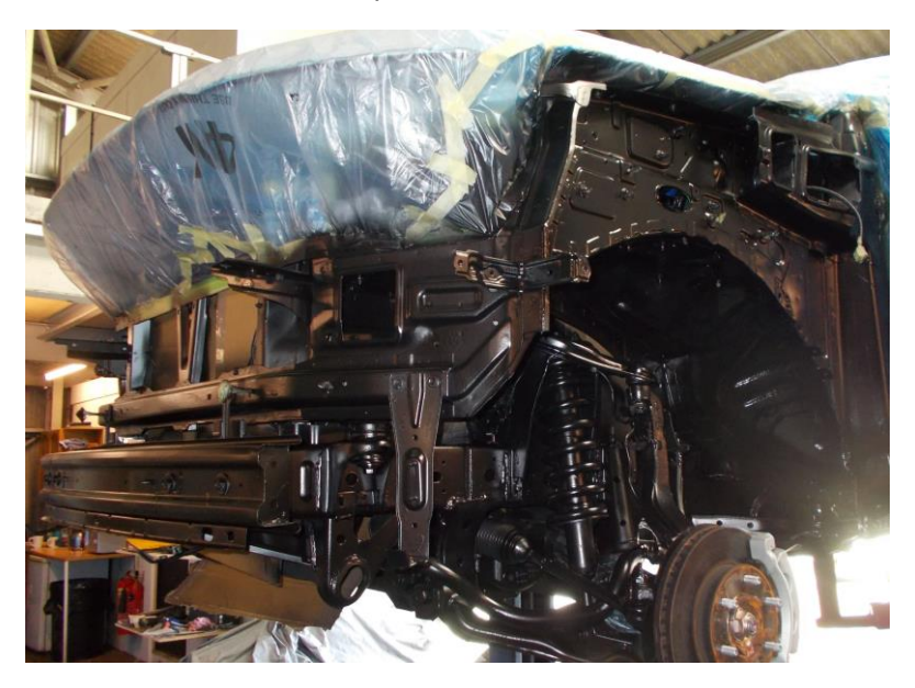
Rustbuster EM121 Epoxy is applied in two coats to all areas of the vehicle.