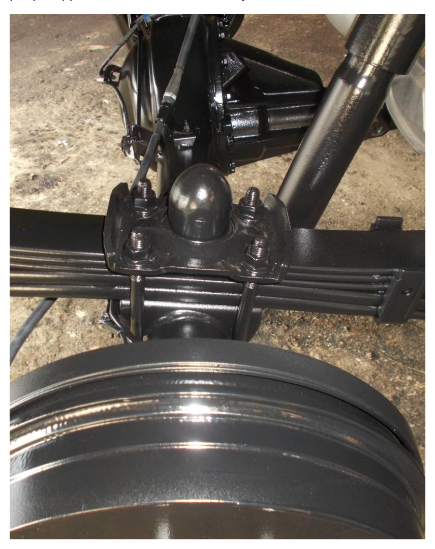
Brake drums springs the rear axle shock absorbers etc all coated in Rustbuster EM121