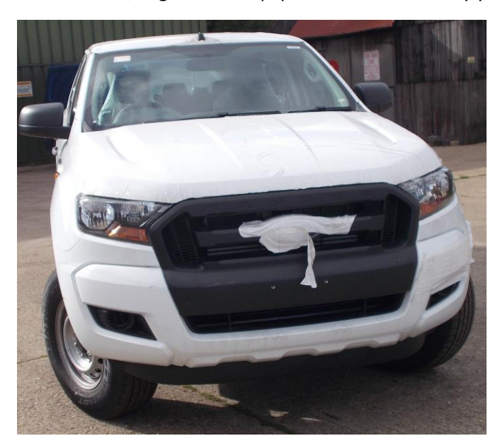
The brand new Ford Ranger arrives Rustbuster's Spalding premises

They called Rustbuster and this is the case history of what we did to provide protection to this vehicle. The RNLI have long been a customer of Rustbuster using our Rustbuster EM121 Epoxy coating on their sea tractors chassis, engines and equipment for over twenty years.