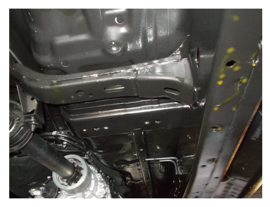
After the Epoxy is applied all of the cavities are injected with Rustbuster Classic Cavity wax