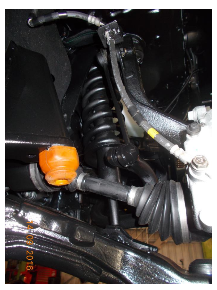
Front suspension coated brakes and hoses are masked.