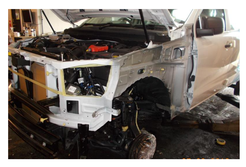
Bumpers, under trays, lights, wings and all plastic arch splash guards are removed