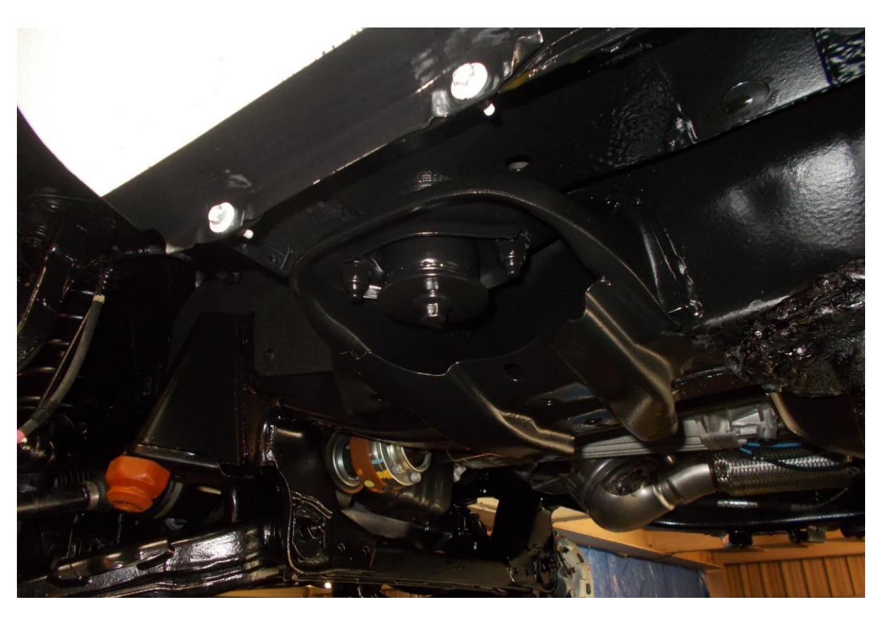
Body mounting points and sill bottoms coated in Rustbuster EEM121 Epoxy