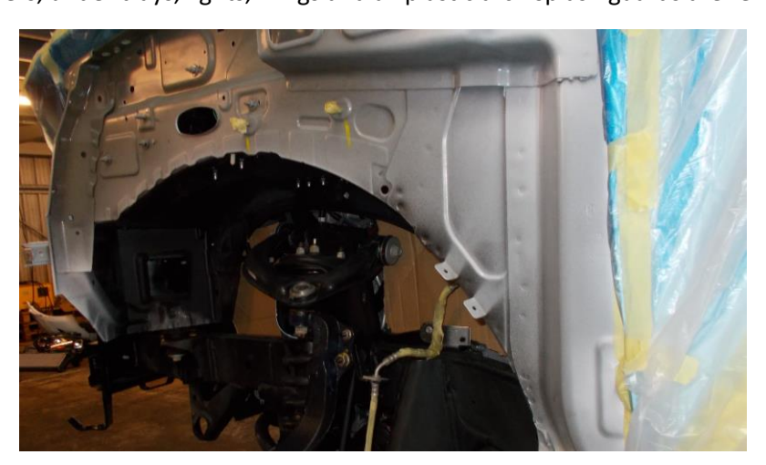
Body work is masked