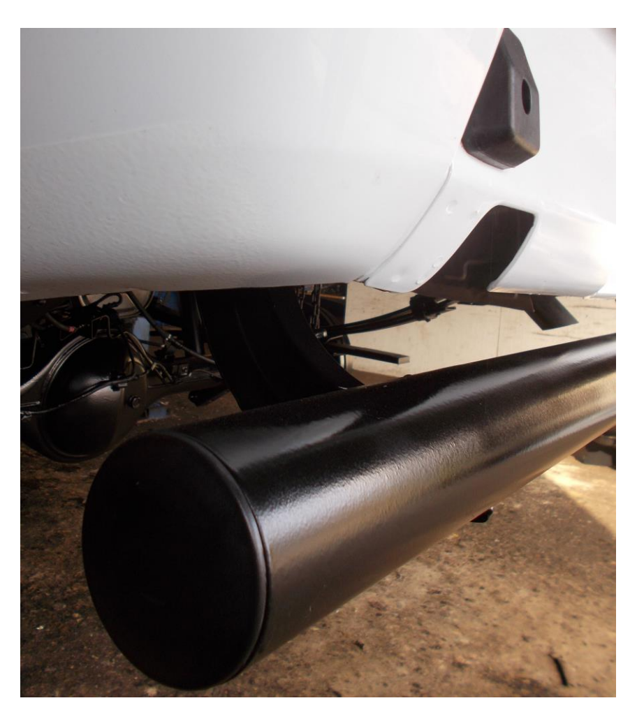
Rear bumper bar coated with Rustbuster EM121 Epoxy