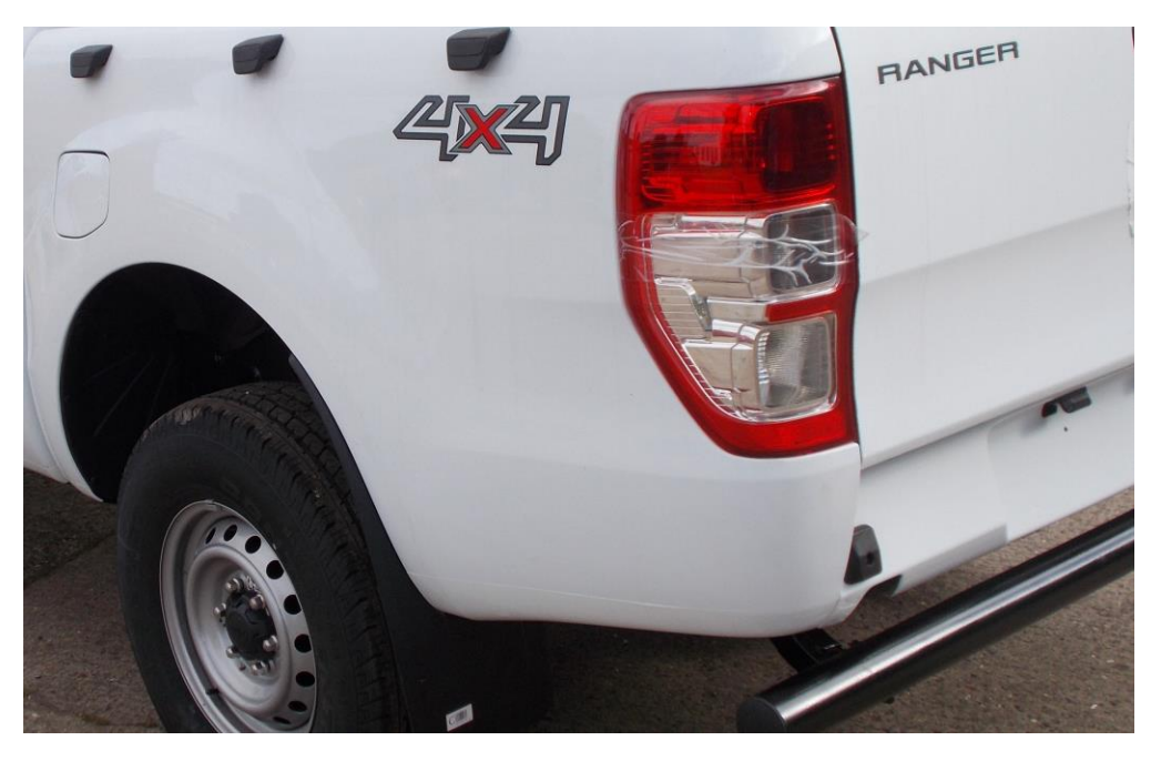
Refit wheels clean up and return to customer, all of the above works where carried out by Rustbuster Ltd trained technicians at our Spalding Lincolnshire premises. For a quotation on coating your vehicle with Rustbuster Epoxy Mastic EM121 please feel free to call.